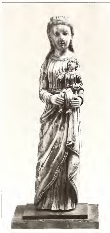
Figure 5. Madonna and Child . India, probably Goa, ca. 1550–1650. Ivory, 37.1 x 13.3 x 11.3. Williams College Museum of Art, Karl E. Weston Memorial Fund, 84.22